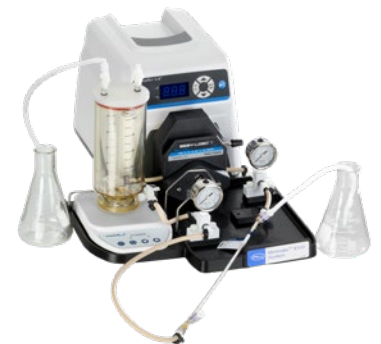
Minimate EVO system with MidGee hoop cartridge