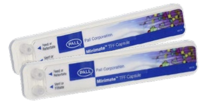
Minimate tangential flow filtration capsules