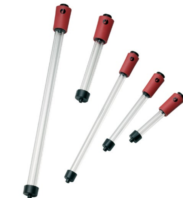
Fig 1. Tricorn empty high performance columns.

A moveable adapter simplifies adjustment of the bed height and maintenance, and a locking ring protects the resin bed from compression by accidental turning of the adapter. The triangular shape of the adapter prevents the column from